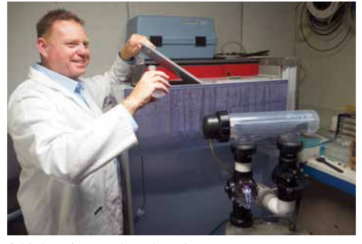
Oxi Swim underwent strict testing at Somerset College before being approved by Gold Coast Council in 2019 for use in commercial swimming pools.

There are two Somerset College swimming pools now sanitised by Oxi Swim: a 50,000-litre infant pool and 100,000-litre learn-to-swim pool.