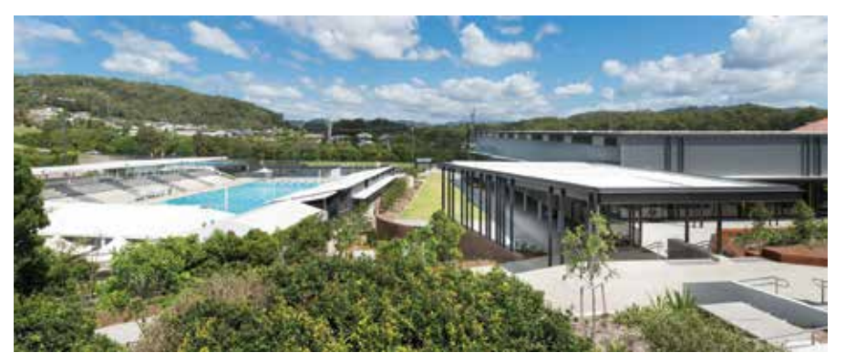
There are two Somerset College swimming pools now sanitised by Oxi Swim: a 50,000-litre infant pool and 100,000-litre learn-to-swim pool.

"Oxi Swim is a non-chlorine-based pool disinfection system which provides a safe and pleasant swimming environment without the harsh side effects of chlorine (Chloramines)," Forrest explains.